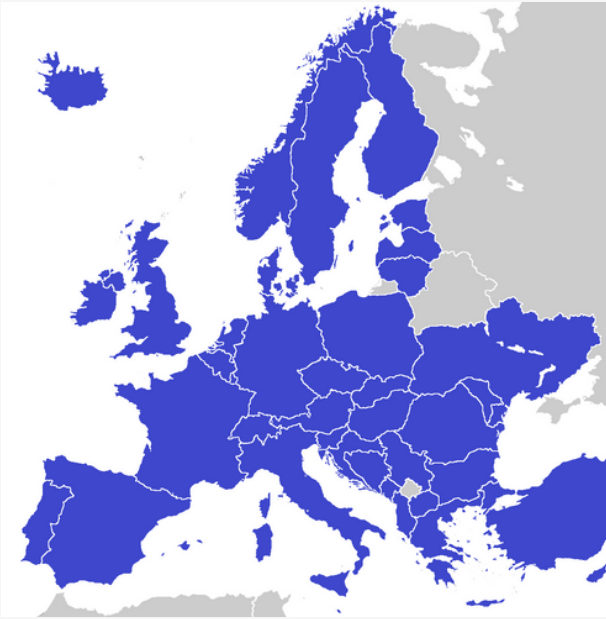
Missing countries: Armenia, Azerbaijan, Georgia.